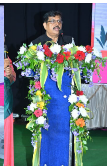
Adoption Awareness Month 2024 celebrated in Andhra Pradesh with collaboration of State Adoption Resource Agency (SARA) on 28.11.2024.