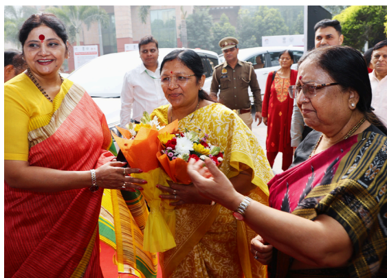
Smt. Savitri Thakur, MoS WCD, GoI was the esteemed chief guest of the Conclave.

The Annual Conclave on Raising Adoption Awareness was successfully held in Lucknow on 21st November 2024. The event aimed to increase awareness about adoption processes, rights, and challenges, while advocating for a more inclusive, supportive society for older children in need of care and protection.