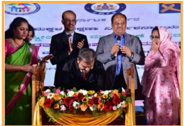
PAPs meet organised in Bengaluru, Karnataka on 30.11.2024