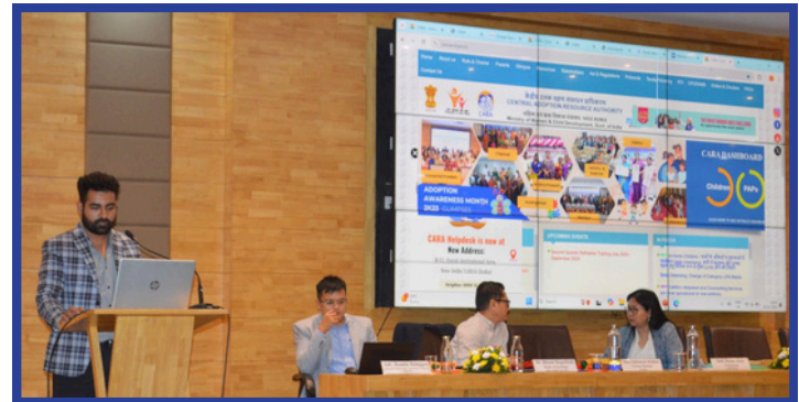
Adoptive Families & Prospective Adoptive Parents Meet organised in Itanagar, Arunachal Pradesh on 29.11.2024