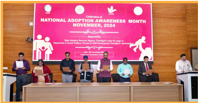
Pledge Taking Ceremony on Legal Adoption conducted in Chandigarh on 25.11.2024