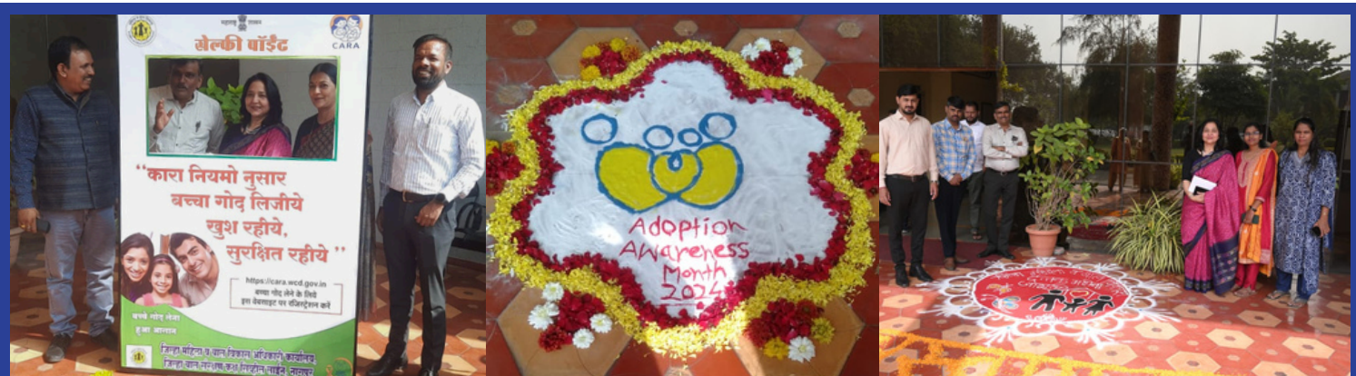
To celebrate Adoption Awareness Month, Adoptive Parents & Prospective Adoptive Parents meet organised on 30.11.2024 in Nagpur, Maharashtra.