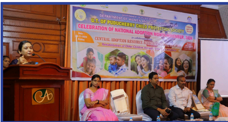
Adoption Awareness Month 2024 celebration program organised in Puducherry on 29.11.2024